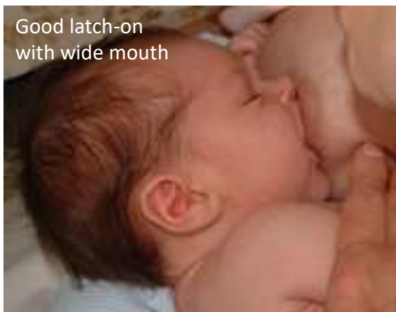
Good latch-on with wide mouth